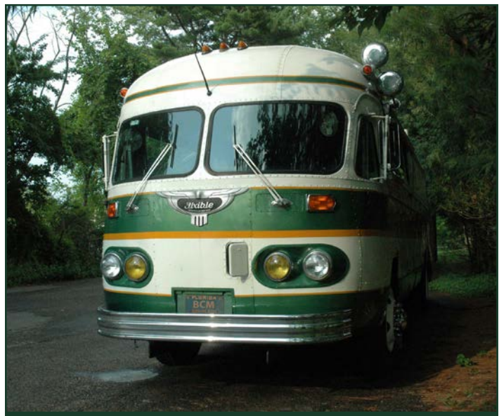
Front view of the Stanley's Bus.

In my teenage years, I loved anything with a motor in it and as I came to driving age I was always buying and improving muscle cars and 4x4 trucks. To this day, collector cars continue to be an interest and hobby of mine.