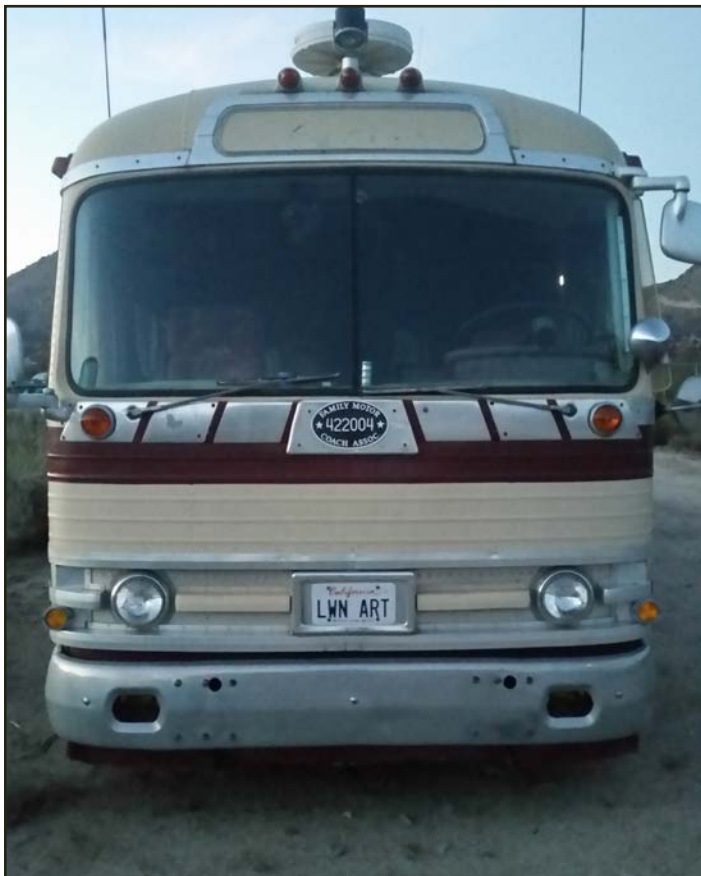
Our 1957 PD 4104 is aptly named “Lawn Art”.

They left a viewing hole so you could see down there, but no access to the area. Seeing that this repair was way above my ability, I asked friends